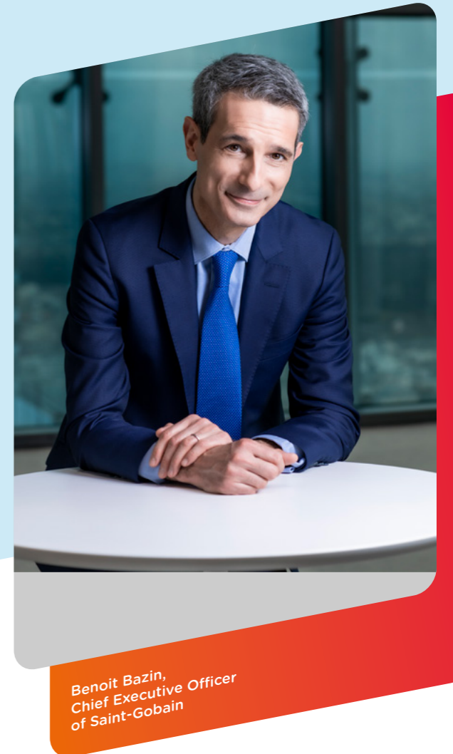
Benoit Bazin, Chief Executive Officer of Saint-Gobain

Today, with the official launch of the Team Saint-Gobain of top-level athletes and para-athletes, we are taking a new step in our mobilisation for Paris 2024. This team of up-and-comers on the French athletic landscape is made up of seven strong, determined personalities who will have the honour be supported by the triple Olympic champion Luc Abalo. In turn, they will reinforce the worldwide collective momentum already underway among our more than 160,000 employees. That momentum pushes us to be always #AIMINGHIGHER .